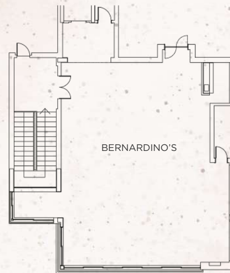
PISO | FLOOR 2