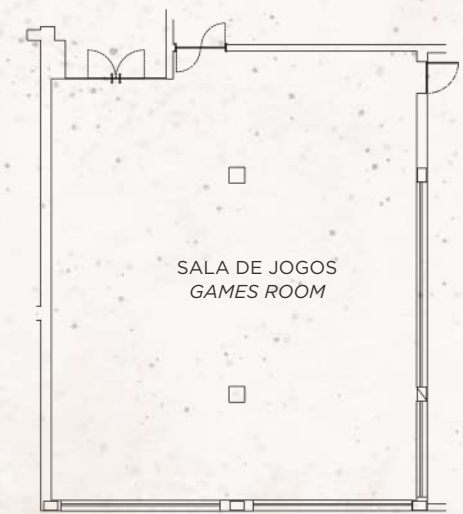
PISO | FLOOR 0