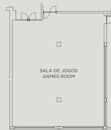
PISO | FLOOR 0