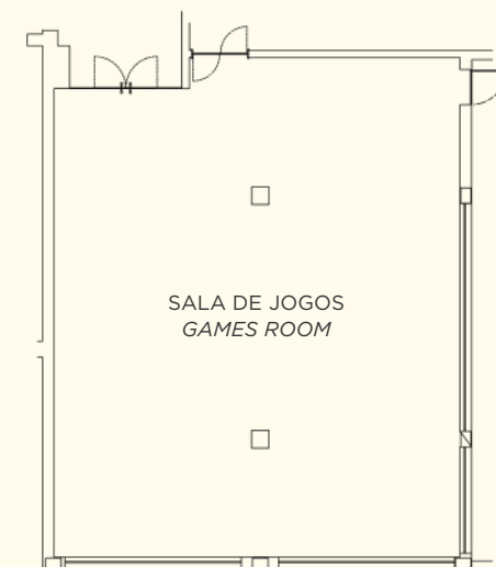
PISO | FLOOR 0