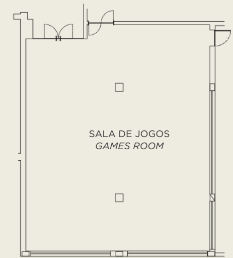
PISO | FLOOR 0